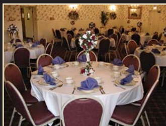
The Banquet Hall